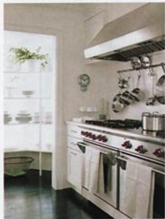
Terrell's kitchen also includes a deep stainless-steel Kohler sink, twin Sub-Zero refrigerators, and twin Wolf ranges.