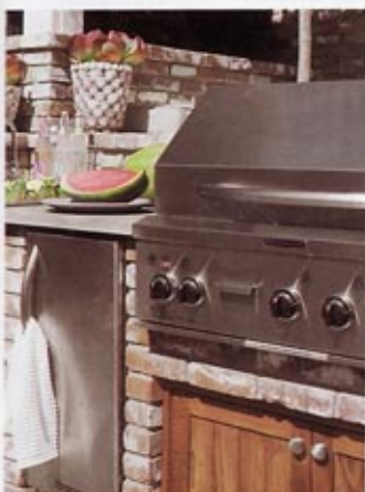
Tim Clarke's outdoor living room, with all-weather Sutherland furniture, also includes a KitchenAid refrigerator and grill, left.