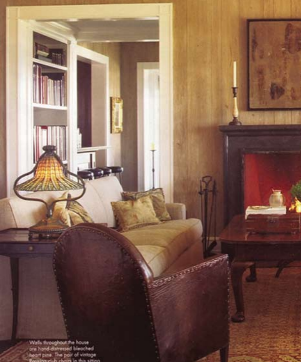
Walls throughout the house are hand-distressed bleached heart pine. The pair of vintage Reichenbach chairs in this scene