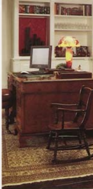
ABOVE: A burled walnut reproduction of a desk was made from reclaimed timber and has a leather inlay top. The desk is accented with a reproduction of an Emile Gallé lamp and an antique child's rocking chair.

is supported with unadorned white limestone. The base of the fireplace, of Pennsylvania fieldstone. The mantel, of the same fieldstone, is subtly inscribed with the name of the house. On the house's second story, a dormer window is suggestive of a Nantucket widow's walk, which looks out over the bedrooms into the out-of-doors. A small, white, boxlike structure on the Pacific coastline, where boxlike structures are common, the walls of glass prevail, the house is a modernist's dream.